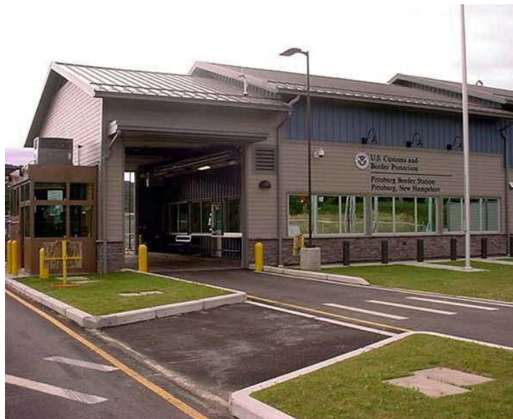
Roughly 7,400 passenger cars and 1,150 commercial vehicles go through the U.S. port at Pittsburg each year. Most of the traffic comes in the summer vacation months of July and August.