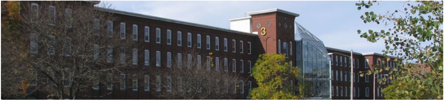
The Millyard Museum is housed in Mill No. 3 at the corner of Commercial and Pleasant Streets in the historic Amoskeag Millyard.

The maker movement has revealed more than a desire to make things, since we all can't be inventors or artists. The rest of us love to see how and where things are made.