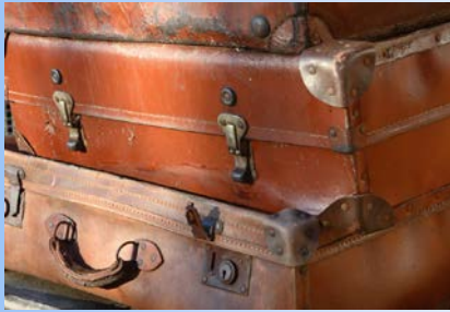
Prepared for New Hampshire Division of Travel of Tourism Development